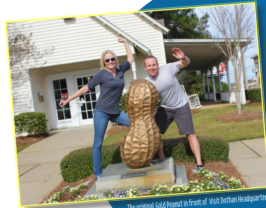
The original Gold Peanut in front of Visit Dothan Headquarters

The Official Guide for Dothan's most unique attraction!